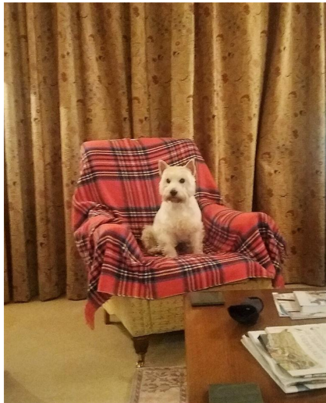
The perfectly posed and pampered Presidents Pooch!