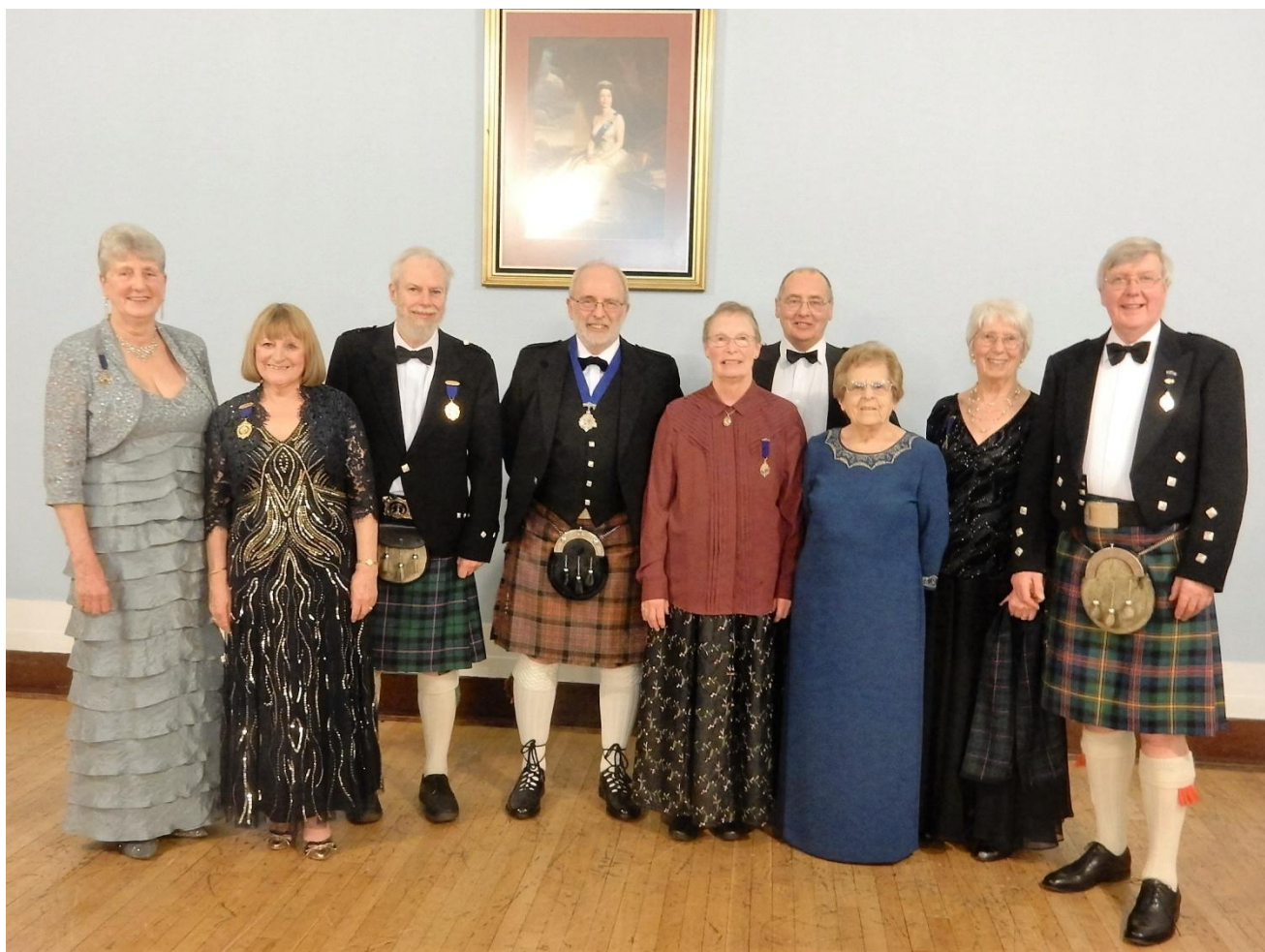
The President with past Presidents

After Auld Lang Syne at Midnight we all bade our farewells and went hame to bed. Another year gone and a thoroughly enjoyable evening. Can't wait for 2018.