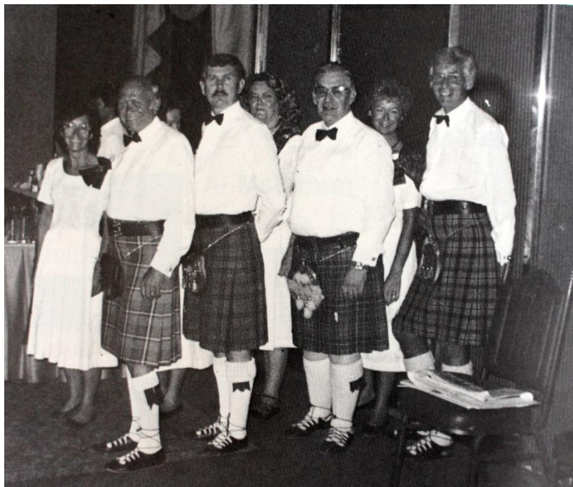
Caledonian Ball, Dubai

Later on, in 1989, when I moved to Bophuthatswana and found no evidence of a Scottish community, I was disappointed. 'Bop' was one of the Southern African Homelands , described as "a scattered patchwork of individual enclaves". Sun City was in one of these and Mafikeng (known by the British as Mafeking) in another. As November approached I put a small ad in The Mail to see if there might be any interest in a celebration of St Andrew's Day. And it brought Scots crawling out of the woodwork, including several pipers, an accordionist, a Highland dancer, a penny whistle player and lots of country dancers - and a butcher who made his own haggis.